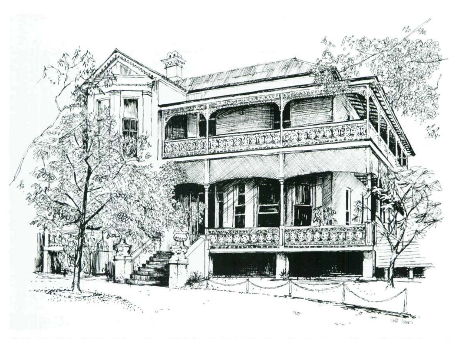
'Rhyndarra' - the original residence is important as a prestigious, albeit refined, example of the domestic architecture of the period, not common at this stage of Brisbane's development and being reserved for more prominent or wealthy citizens. It is indicative of the town's growing prosperity and optimism for the future, and is one of the relatively few extant examples of its type in Brisbane.