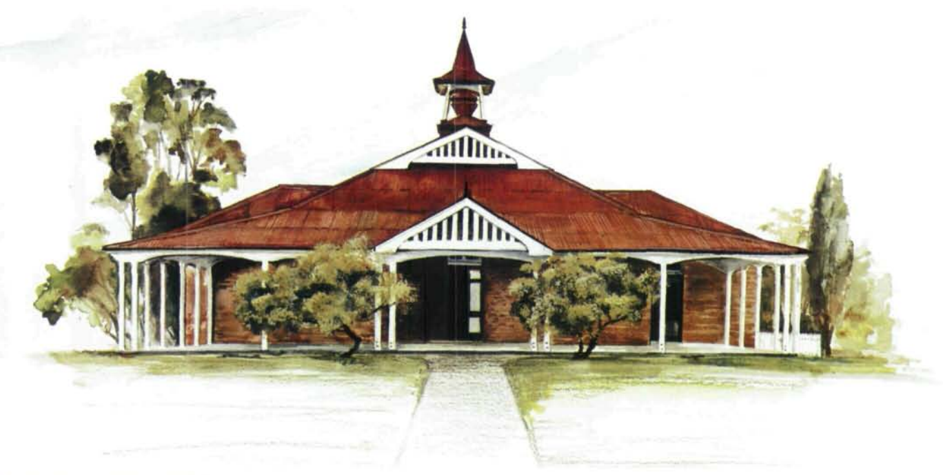
All Saints Chapel was built as a school of musketry and later served as a senior officer's residence.

When the building was converted into married quarters new stud partitions to provide additional rooms were added. A new toilet, bathroom and shower were added, all with a terrazzo slab laid on the existing floor. The old lavatory basins, counters, lockers and gun racks have been removed. New kitchen fittings were also added in the old armoury room. The building proved less than satisfactory as a home, primarily on account of its exposed position on the busiest traffic junction, close to the entrance to the Barracks. It was converted for use as an inter-denominational chaplaincy centre, All Saints Chapel, and officially opened by the then Chief of the General Staff, Lieutenant General (later His Excellency General Sir Philip) Bennett in 1982.