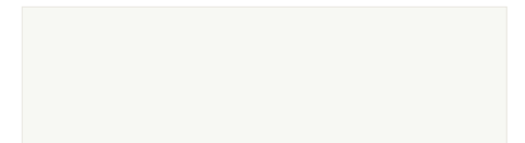
EAVES/ALFRESCO/SOFFIT Dulux Vivid White