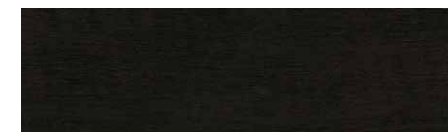
FRONT DOOR Intergrain Ebony