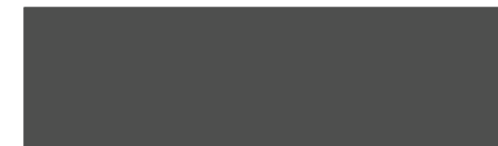
COLORBOND® ROOF Monument®