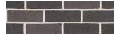
BRICKS PGH Dark & Stormy, Thunder