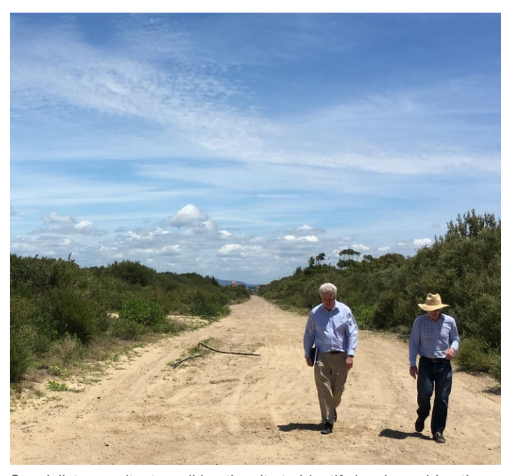
Specialist consultants walking the site to identify local considerations.