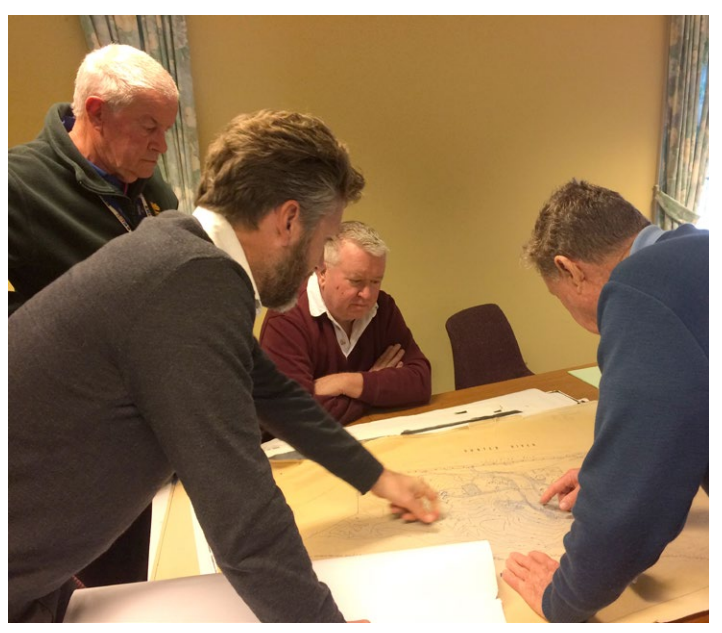
DHA Development Manager discussing Fort Wallace with President, Vice President and Curator of Fort Scratchley Historical Society, July 2016.

To develop parts of both sites for residential uses, the planning controls need to be amended. The process is called a "Planning Proposal" or "rezoning". The Planning Proposal will be submitted to Port Stephens Council and Newcastle City Council, and will also need to be assessed and determined by the State Government.