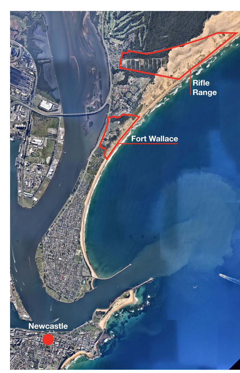
Aerial image highlighting Rifle Range and Fort Wallace north of Newcastle

With the ongoing support of our many happy investors and our valued partners, we will continue to build futures for all Australians.