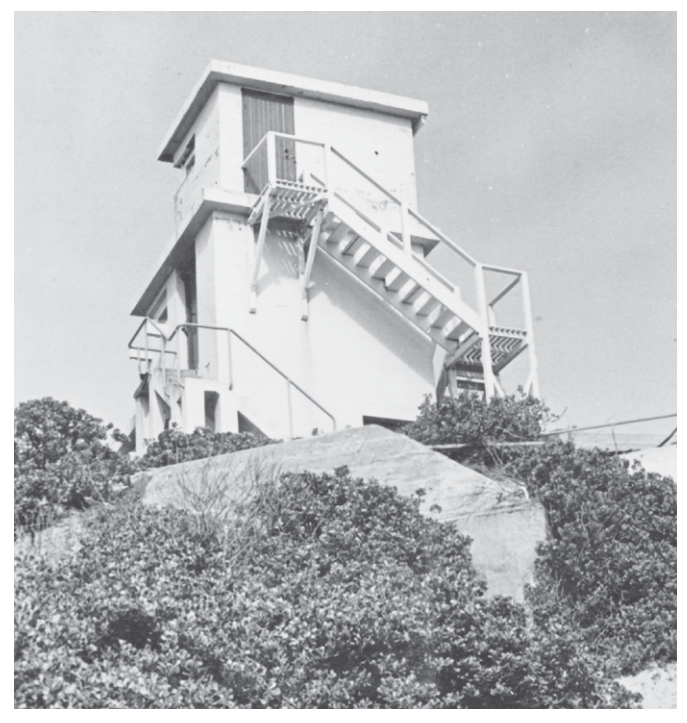
Fort Wallace Observation Tower - historical image

We intend for these sites to provide future residents, and the wider Stockton community, with the opportunity to connect with the natural environment and the sites' heritage. Our aim is to create a vibrant sustainable community with world's best practice as the benchmark.