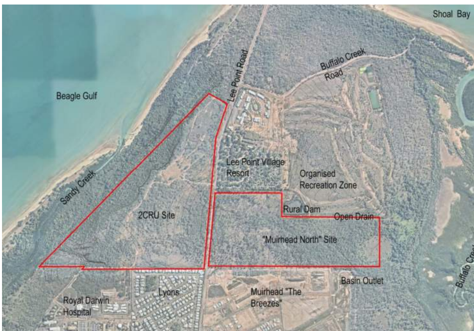
Figure 1-1 Location plan

The site location and proposed staging plan are depicted in Figures 1-1 and 1-2 below.