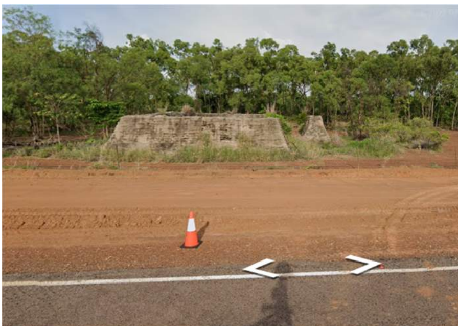
Figure 7-2 'The Bunkers'